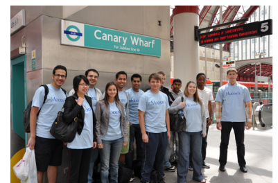
Summer Interns Afternoon of Service , London

» London – On July 13 and 14, interns contributed a combined 56 hours of service at Stepney City Farm. The group dug out and moved approximately three tons of soil to make way for a new concreted cow shed, sifted approximate three wheelbarrows of soil, made 19 cuts in 10 pieces of timber and screwed in 10 very long screws... Well done!