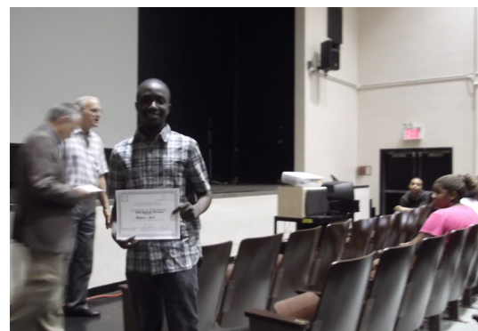
Moody's Summer Experience Program at the High School of Economics & Finance Graduation Ceremony

It was another successful year of the Moody's Summer Experience at the High School of Economics & Finance (HSEF) in lower Manhattan. High attendance and excellent graduation rates are what made this year great. The Moody's HSEF Summer Experience program makes a significant difference in preparing incoming freshmen for high school and in improving their academic performance. The program improves students' knowledge and skills in all subject areas by statistically significant levels, and studies have shown participants performed better academically and attended school more regularly than those who do not. Additionally, participants have better GPA's at a statistically significant level than non-participants. As a result of these outcomes, the school administration and staff consider this program essential to the success of incoming ninth grade students.