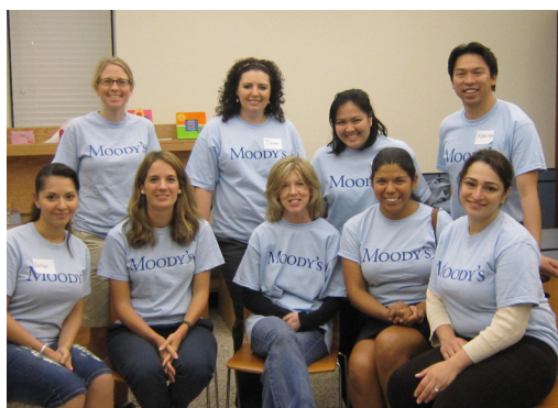
Women's Employee Resource Group, NYC

New York: Multicultural Employee Resource Group - On August 11, eleven members of the Multicultural Employee Resource Group contributed 33 hours of service to Dock to Doc where they identified, labeled, padded and prepared for shipment 14 suction units, 2 B/P kits with stands, 6 pairs of crutches, 2 wheelchairs, 1 CPM machine, mammography equipment, 2 exam tables and lights, 2 respirators, 2 pediatric scales and 32 boxes of medical supplies shrink-wrapped onto a skid.