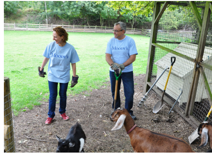
Moody's Afternoon of Service , London