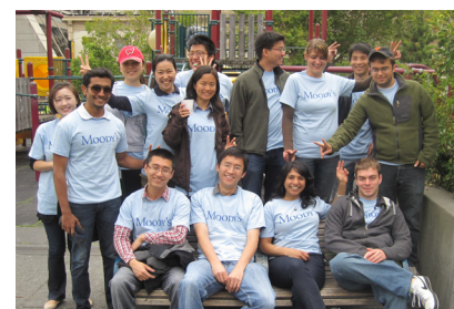
Summer Interns Afternoon of Service , San Francisco