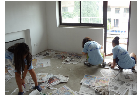
Moody's Afternoon of Service , Beijing

Dallas - On July 27, 14 employees collectively contributed 42 hours of service to Children's Medical Center where they prepped and participating in art activities with children at the medical center.