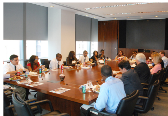
Youth About Business Lunch