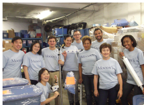
Multicultural Employee Resource Group, NYC