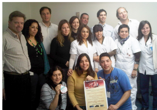
Buenos Aires Blood Drive

The September book drive collected over 520 books for Kids Research Center.