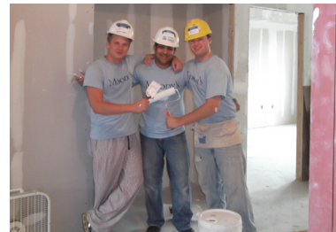
Habitat for Humanity NYC