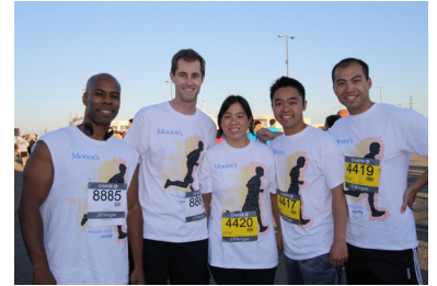
JPMorgan Corporate Challenge San Francisco

San Francisco – On September 21, five employees joined together at McCovey Cove to collectively run a total of 17.5 miles for Larkin Street Youth Services.