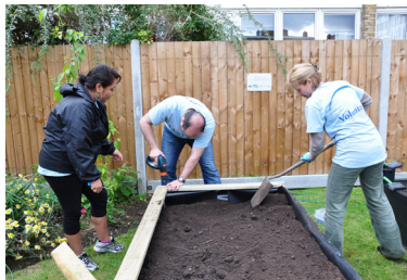
UK Saturday of Service

Habitat for Humanity New York City – On September 24, 15 volunteers helped clean and prep houses at the St. John's Residences in Brooklyn, New York.