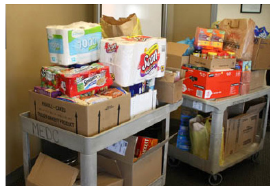
West Chester Food Pantry Food Drive

In July, the West Chester, PA office coordinated a food drive for the local West Chester Food Pantry. The Food Pantry asked for food and personal care items and Moody's Economy.com really came through. West Chester employees donated numerous cases of pasta, rice and sauce, plus cases of peanut butter and jelly, cereal, canned fruits/veggies and bottles of juice. The pantry collected a case of toothpaste and tooth brushes, a case of shampoo and conditioner, packs of diapers, wipes and baby wash plus deodorant and a box of cleaning products. The total weight of the items was 426 lbs. Great job!