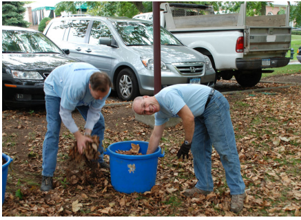
Moody's Afternoon of Service , NYC