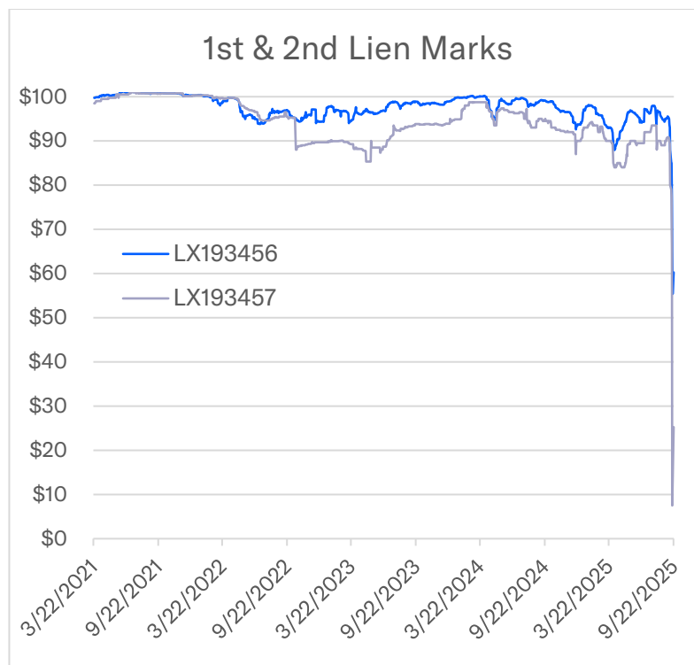
FIGURE 1 Marks for Two Largest Positions